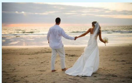
Weddings & Social Events